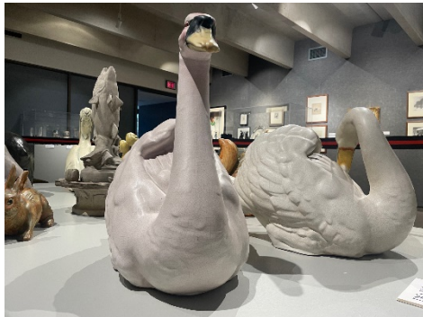
Garden ware swans