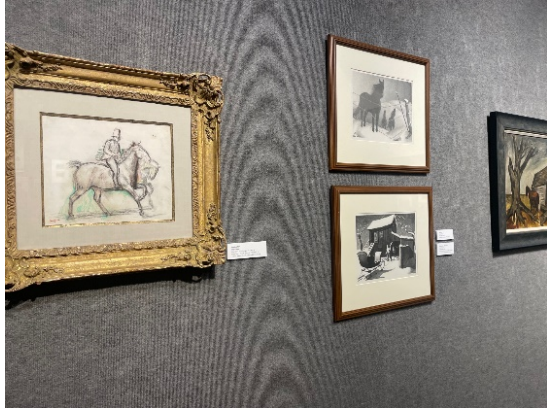
Charcoal and pastel drawing by Edgar Degas displayed next to two lithographs by Grant Wood.

charcoal and pastel by Edgar Degas next to lithographs by Grant Wood.”