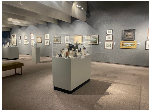
Works of art featuring horses are displayed on the middle floor of the Stanley Gallery while an array of American Art Pottery depicts pets and farm animals.