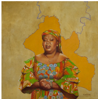
Leymah Gbowee 2011 Laureate

In addition to the performance, concertgoers will be treated to the visual delights of painted portraits by Cecile Houel, whose portrait of the Dalai Lama was included in the Muscatine Art Center’s 2020 invitational exhibition, "Hard Won, Not Done".