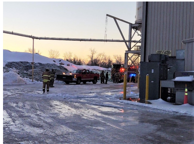
Muscatine firefighters work a machine fire inside a glass recycling building in Progress Park Tuesday morning.

The Muscatine Joint Communications Center (MUSCOM) received a 911 call at 5:24 a.m. Tuesday of a fire at 4907 55th Avenue West. The building involved is an industrial building that recycles glass.