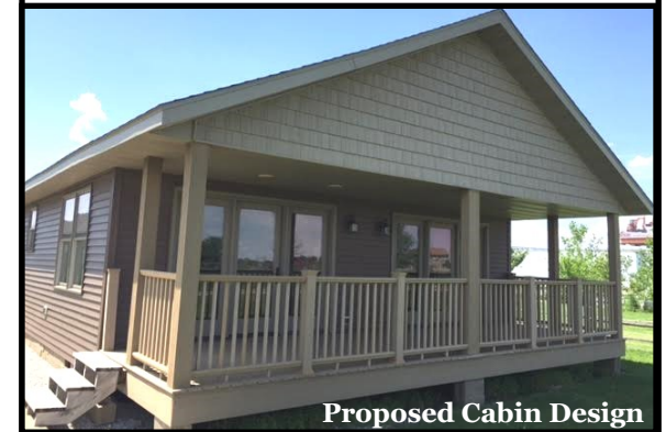
Proposed Cabin Design