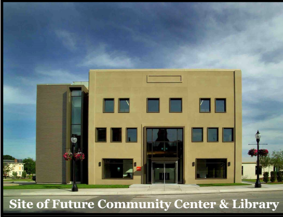
Site of Future Community Center & Library