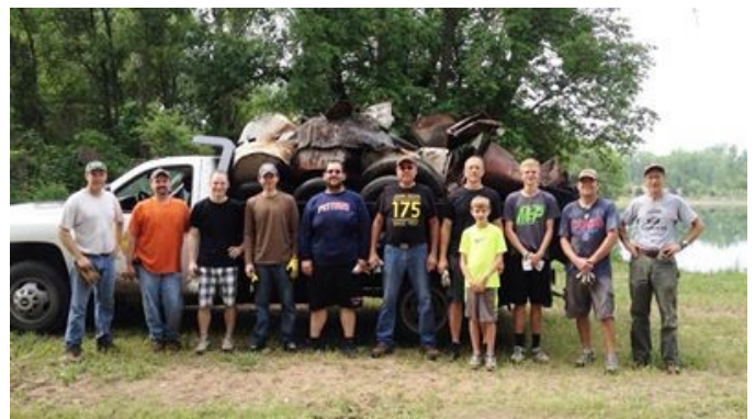
Members of the Monsanto's Team at the June 7, 2014 clean up. Turn to page two for more photos of the event.